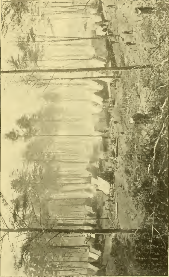
CAMP AT WOLF RUN SHOALS, VA.